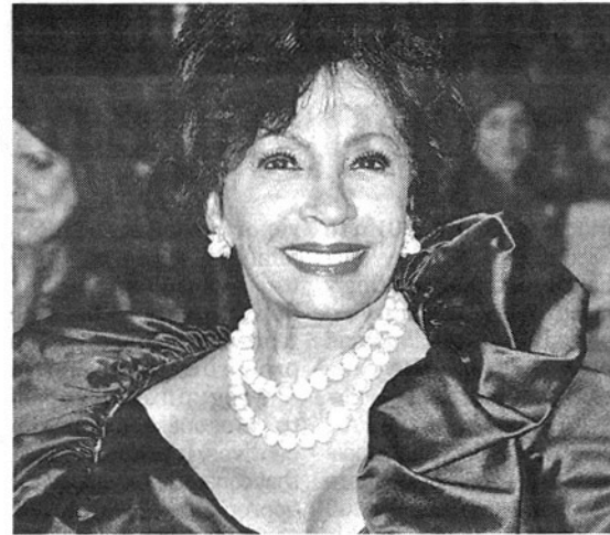
Dame Shirley Bassey

ing the album. Distribution companies like Absolute and Integral offer independent labels the chance to keep hold of artists by providing marketing expertise and financial backing when releasing an album. Dame Shirley plays at the Glastonbury Festival this weekend and has appeared on Marks & Spencer advertisements to promote the record, her first in 10 years.